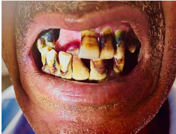
Figure 2: Before treatment-Inter incisal distance-4.8mm