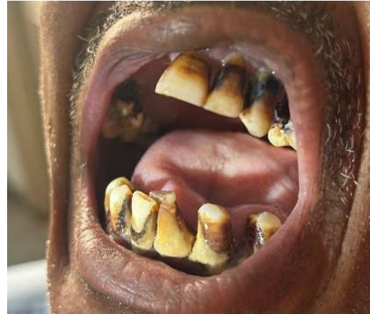
Figure 3: After treatment- Interincisal distance-29.3mm